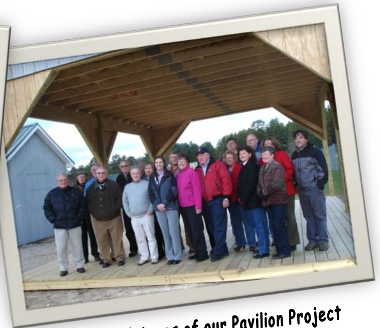
Here are the pictures of our Pavilion Project at our local rec fields called "The Field of Dreams"