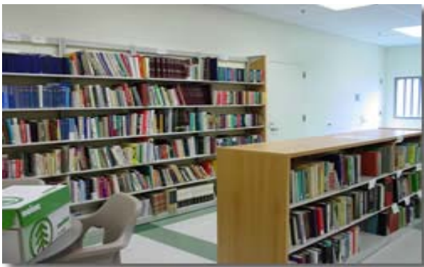
The actual work centers around unpacking the donated books and getting them on the shelves in some kind of order so that when a special request is made, the sheriff's deputies who are handing out the books will know where to look.