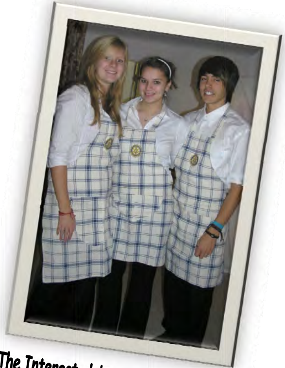
The Interact club act as waiters and find time to get in some dancing as well.

Twinkling lights and festive spirits transformed our usually-mundane American Legion Hall into a winter wonderland for the Boothbay Harbor club's first Warm Winter's Night dance during the Holiday season. While Rotarians and friends danced to the beat of the Big Chiefs band, the decorations and all the trimmings testified to the terrific work done by the dance committee. Meanwhile, Interactors passed the refreshments and sorta gawked at the sight of middle agers enjoying themselves so wholeheartedly. Everyone agreed it was a wonderful evening - with all proceeds going to our community's home heating oil fund!