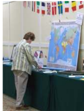
Checking where our District is helping