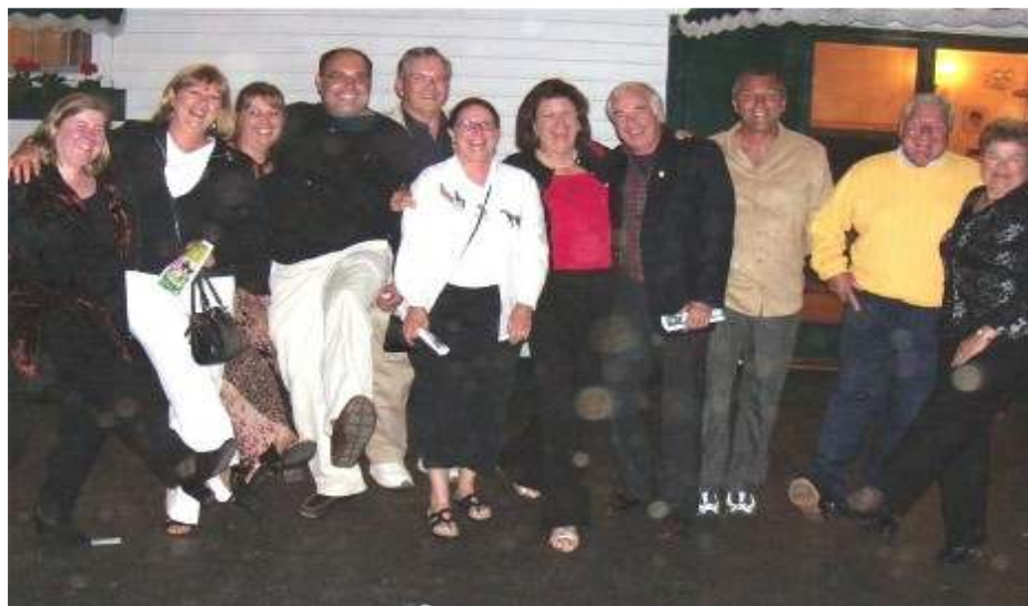
Rotary Club of Ogunquit group at Ogunquit 'PolioPlayhouse' night on June 3. Actually they were auditioning for Chorus Line, the musical that night, and helping to raise money for PolioPlus.