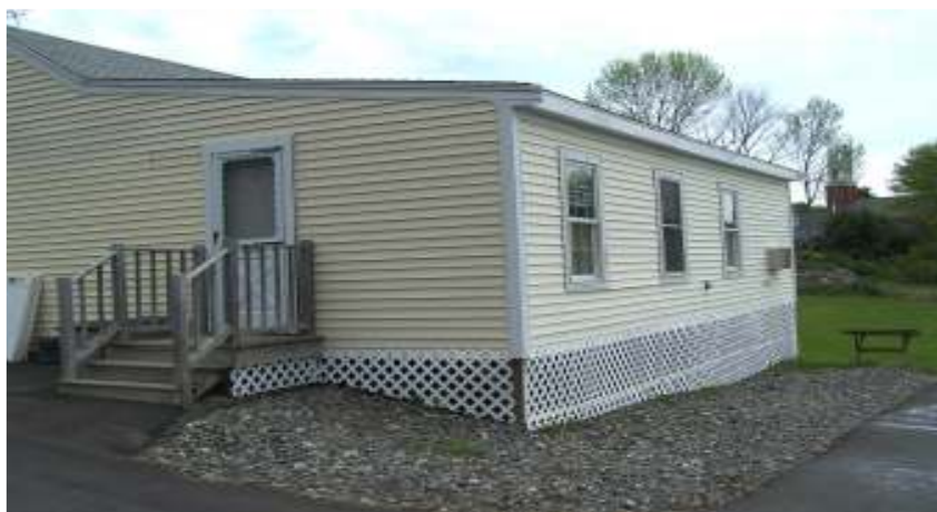
Sea Thrift Cottage All Set!