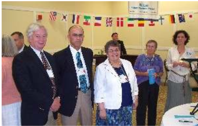
Scenes from the excellant "House of Friendship"