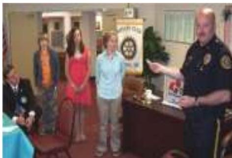
Students of the Month