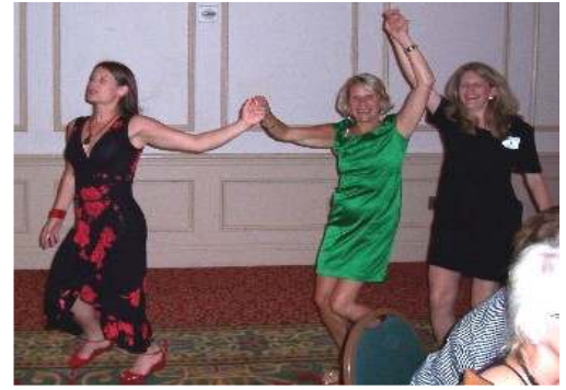
Wild Rotary Women!