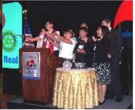
A Very Happy International Birthday Wish