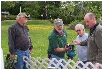
We will figure this out, Rotarians!