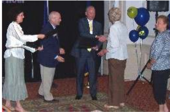
Literacy Award presentations