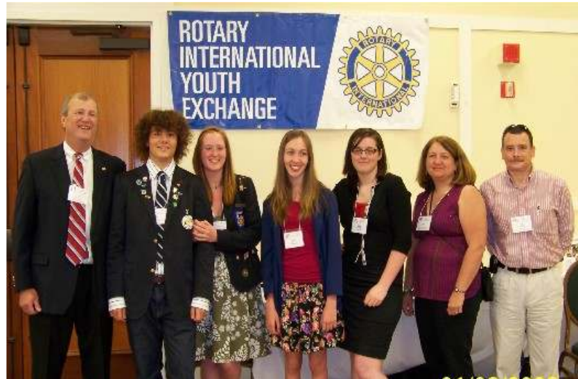
The sign says it all!