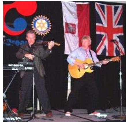
Bobby Darling Show