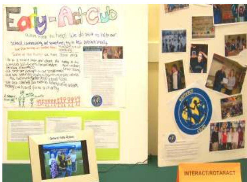
Interact and Rotaract was also well displayed