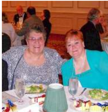
Reconnecting with friends