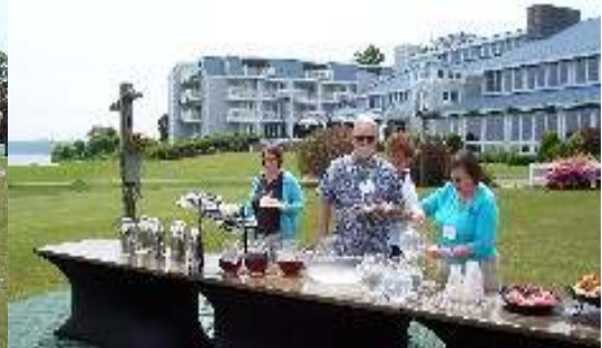
Barbecue on the Patio Friday Noon