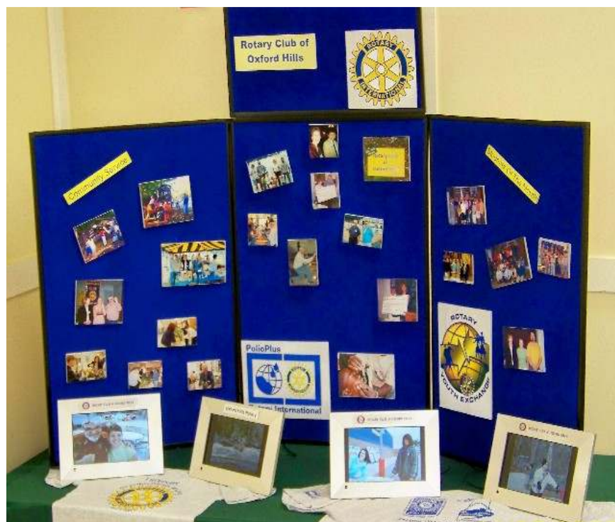
Making very good use of Digital Frames to augment the display