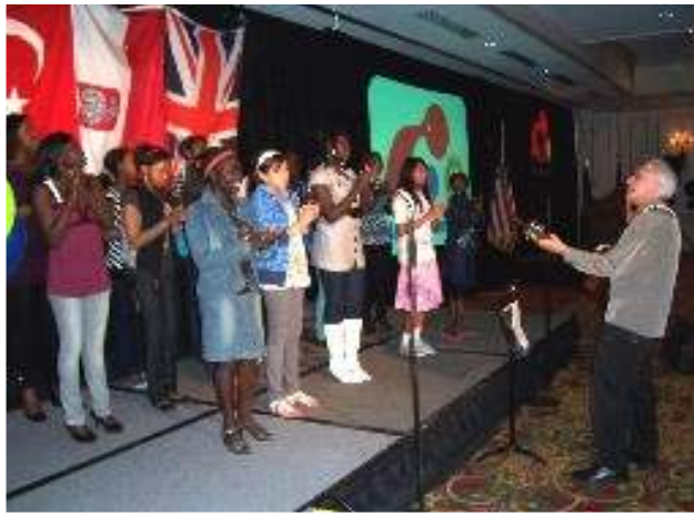
PIHCINTU Maine Children's Chorus