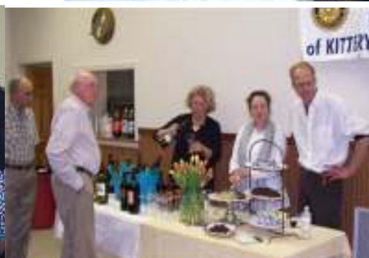
A few of our great many offerings at the Taste of Kittery provided by our great area eateries