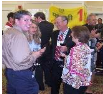
"House of Friendship"