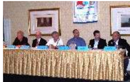
Panel on use of Matching Grants