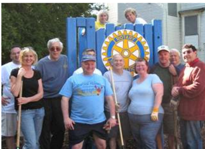
Members of the Hampton Club happily take a break from finishing a spring clean-up of the Rotary Park in the middle of town

On 6/4/09, the Hampton Club celebrated a year of assisting the Seabrook Head Start Program by attending their end of the year breakfast buffet. We were bestowed with a handsome certificate of award and serenaded with some great singing by the kids. We assisted them throughout 2008-2009 with weekly reading to the children and donations of books, winter wear, and hands-on learning material. Our membership really enjoys this relationship with the children and this is the kind of endeavor that makes our Rotary work very worthwhile.