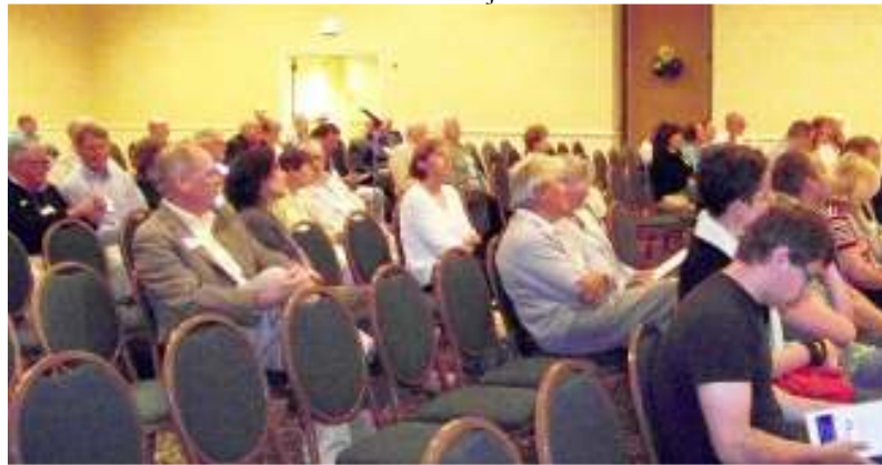
The second Friday Plenary session