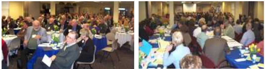
A terrific turnout -a very full hall