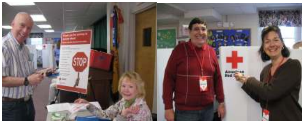
Hampton Club members assist in their last Blood Drive of the year.