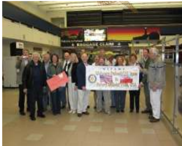
About 20 District 7780 GSE Team Greeters were on hand at the Portland Airport at 10:30 PM waiting the arrival of our Inbound Team