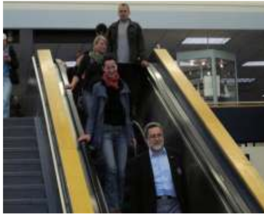
The smiles say it all, the team was very surprised and appreciative at the number of Rotarians at that time of night who were here to greet them