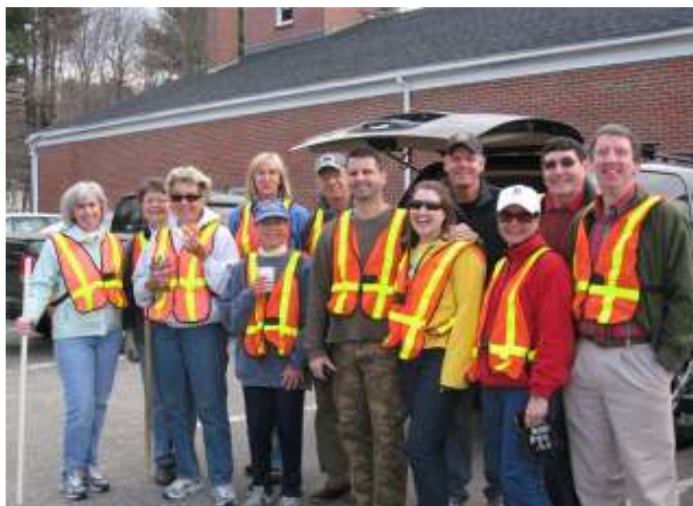
Members of the Hampton Club prepare to clean up a roadside headed to North Hampton Beach after a long winter.