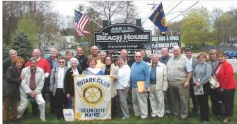
Rotary Club of Ogunquit poses for a picture outside their new meeting place, the Beach House Grill in Ogunquit.