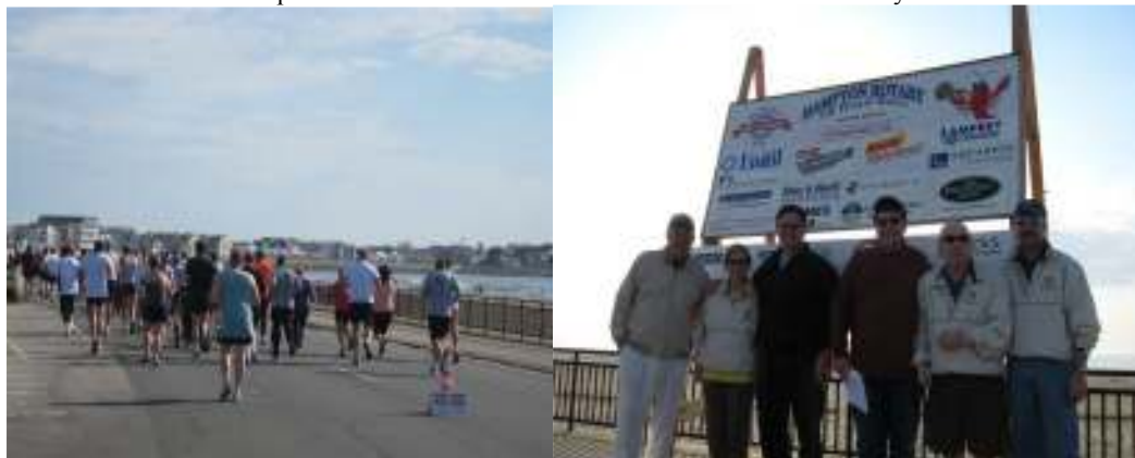
An early morning set up crew gets the Annual 5K Race participants off and running.