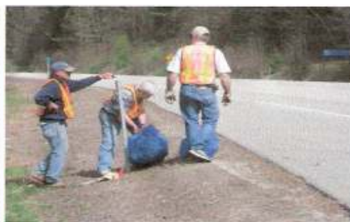
Durham-Great Bay Club Members taking a break

The Rotary Club of Hampton continues to be industrious in 2008-2009. On April 18, we held our semi-annual roadside clean-up. Twice per year, club members get together to clean Atlantic Avenue which leads to the beach in North Hampton. The 23 bags of "stuff!" that we pick up always amazes us!