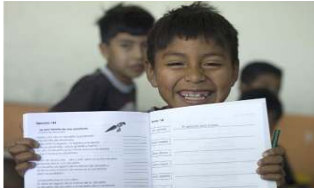
This boy has school books and a pencil thanks to Guatemala Literacy Project