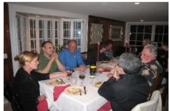
Dinner with the Poland team and a traditional vodka toast with a little wine to wash it down