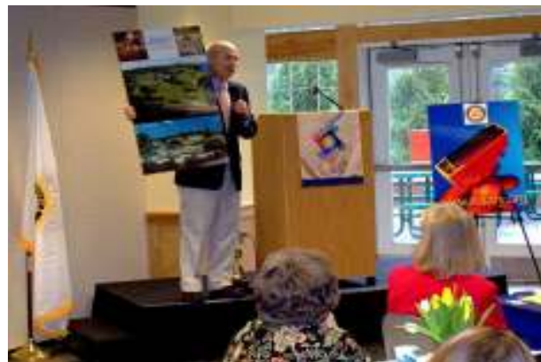
DG Brad encouraged everyone to get their registrations in for the District Conference