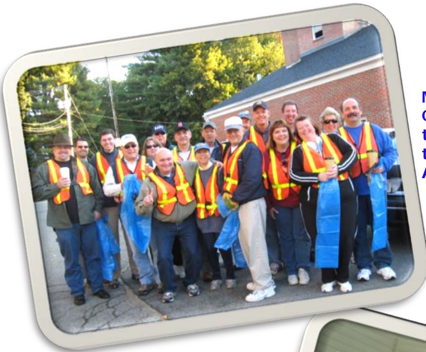
Members of the Hampton Rotary Club pose for a picture during their coffee & donuts before their semi-annual Adopt-A-Highway clean-up.