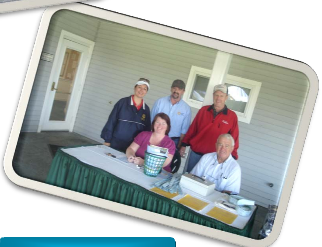
Members of the Hampton Rotary Club work the registration table at their annual golf tournament.