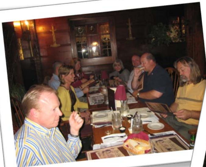
Hampton Rotary at dinner the eve before Home Club Visit