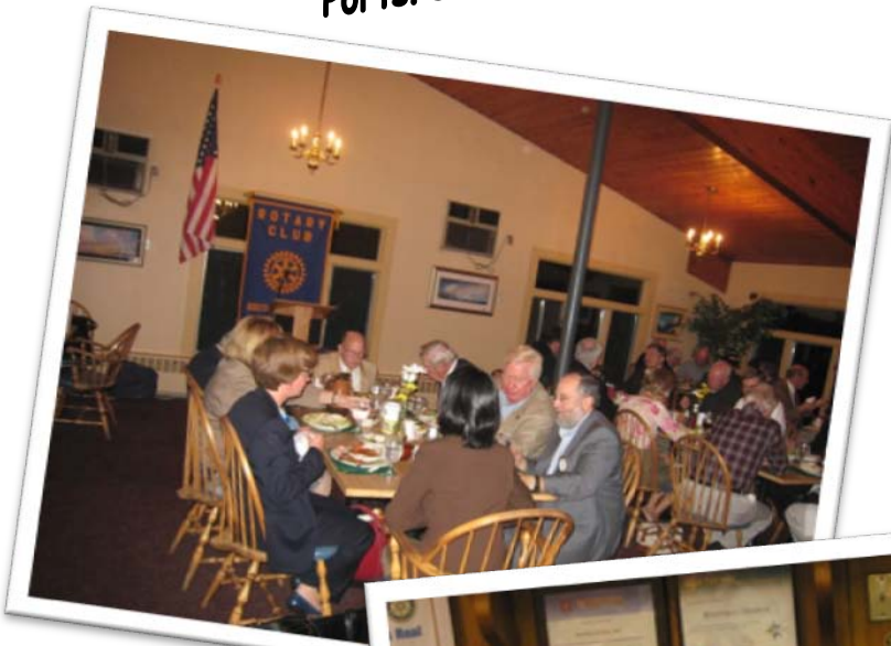
So. Portland Cape Elizabeth Club enjoying fellowship during dinner