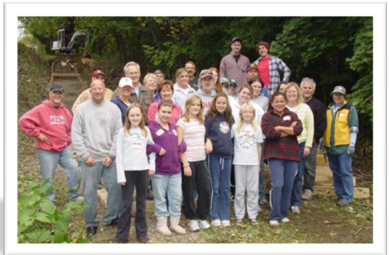
Members of the Rotary Club of Saco Bay, Saco Girl Scout Cadets, Troop 364, Saco Public Works and Saco River Walk Committee