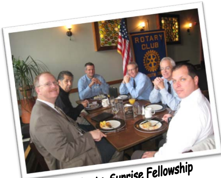
Ports. Sunrise Fellowship