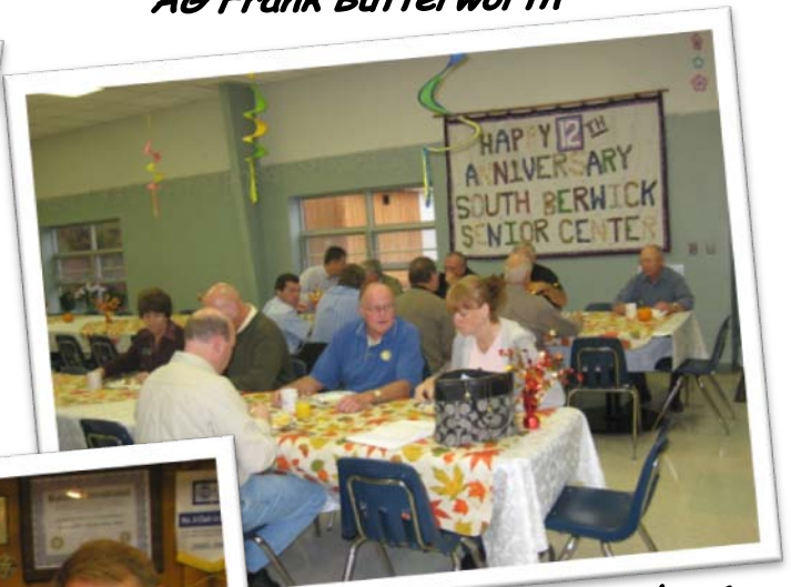
So. Berwick-Eliot Members enjoying fellowship