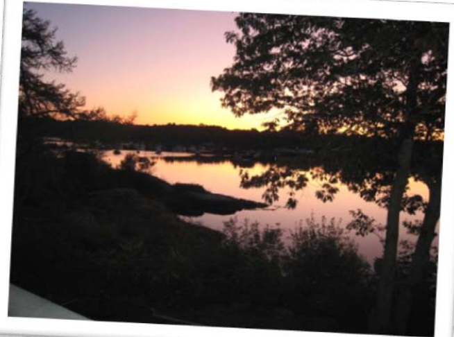
View from the deck of Pres. Phil Congdon