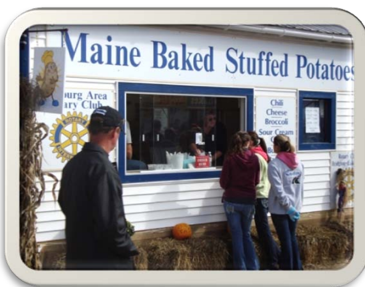
The joint Potato Booth at Fryeburg Fair for Fryeburg & Bridgton-Lake Region Club