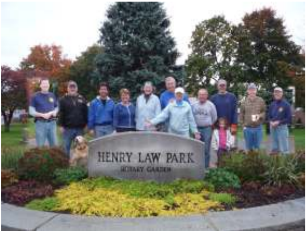
Group shot of Rotarians doing Fall Clean-up at the Rotary Gardens