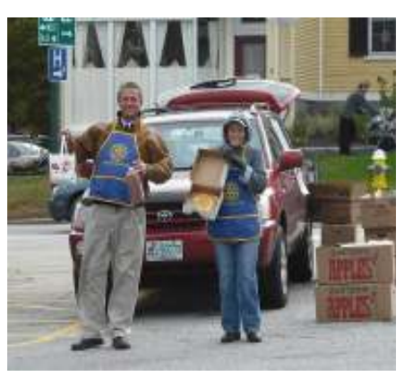
Exeter Club's Annual Apple Sale. Each year, we sell local apples, cider, apple pies and apple crisps in the heart