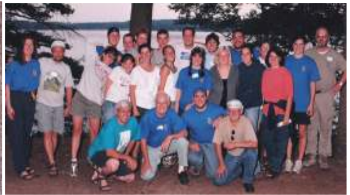
Picture of the staff from 1999