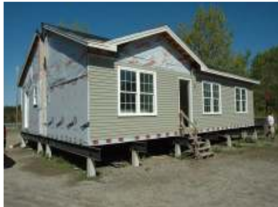
The 2008-2009 almost completed house.