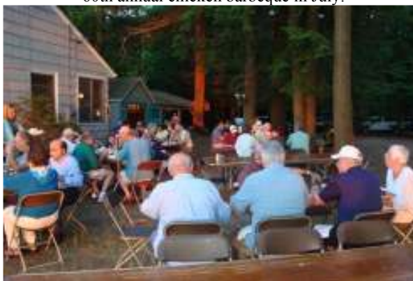
Members of the Kennebunk Rotary Club and their spouses had a great time at their annual Kennebunk Pond cookout.