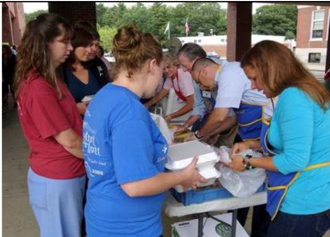
Nearly 900 people enjoyed the Kennebunk Rotary Club's 60th annual chicken barbeque in July.

The club is also gearing up for our biggest fund raiser of the year in September with the Annual Hampton Beach Seafood Festival (9/11-13). Hampton Rotary Club members are responsible for collecting admissions to the festival and doing so requires over 280 shifts over the three day festival which translates to about 4 shifts per member. Look for people with the bright yellow t-shirts and you will see Rotarians in action having fun and living our motto: Service Above Self.