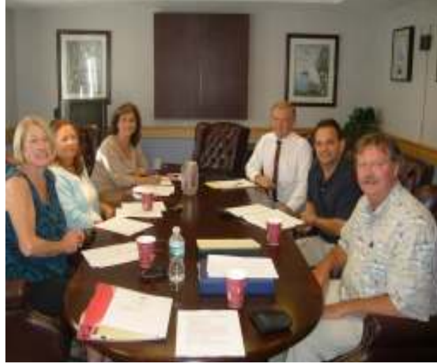
The 2009-2010 Trustees preparing for another exciting project.

The Trust was formed in 1972 and built its first house in that year. The Trust and the (now) RSU 1 vocational program have been building something new every year since. The program essentially works by having the trust providing materials, the school providing the teachers and the students doing the building (while they learn). The buildings are then sold at fair market value when completed. The income generated over and above the cost of the project is held in reserve to start up the next year's project and the rest is allocated towards the purchase equipment, tools and scholarships for the vocational program.