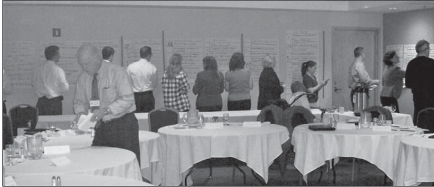
Dover club members vote on ideas for their club's vision