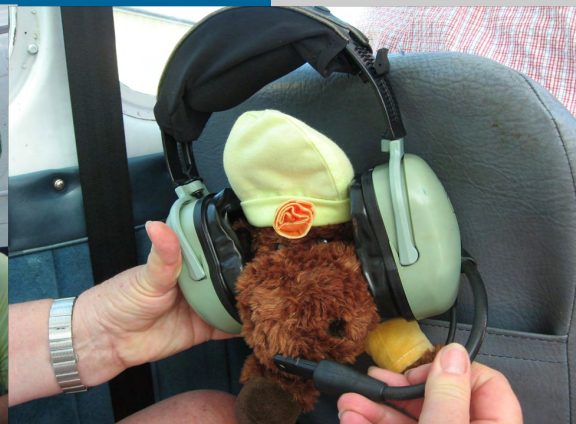
The pilot brought the girls along for the ride