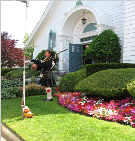
In Edgartown, Momma Moose was distracted by a bagpiper