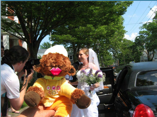
But when she became rambunctious and wanted to kiss the bride,