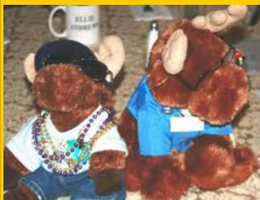
Moose on the loose— Bethel Club