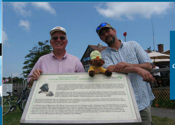
They all landed safely at the Katania Plains and Momma Moose got up close and personal with a Red Barron.