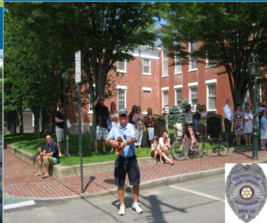
The police took custody of this wedding crasher!