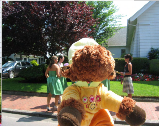
She wouldn't leave till she met all the bridesmaids at the wedding