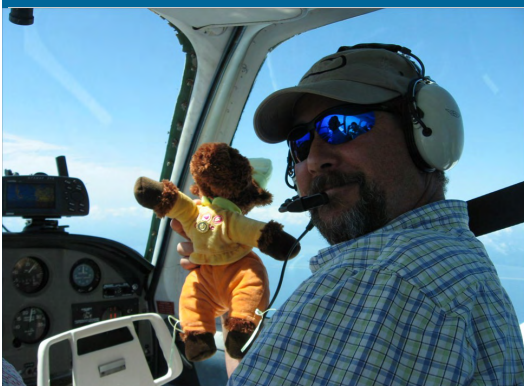
She even got to sit in the cockpit !