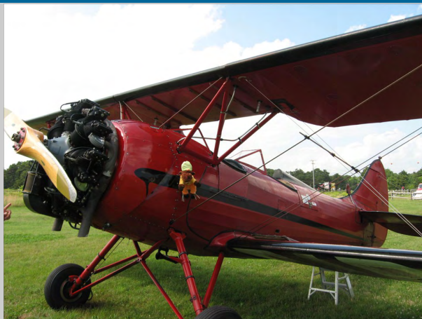
The only way she could escape his clutches was by clinging to the side of the Red Baron which raced her away to her get away place across state lines back to New Hampshire.