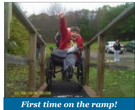
First time on the ramp!