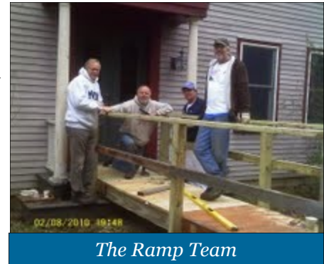
The Ramp Team