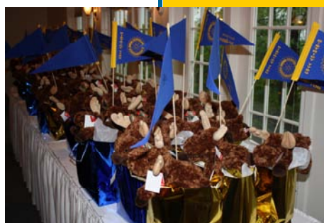
Moose ready to bust "Loose" at the District Changeover