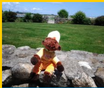
Momma Moose at Rye Harbor