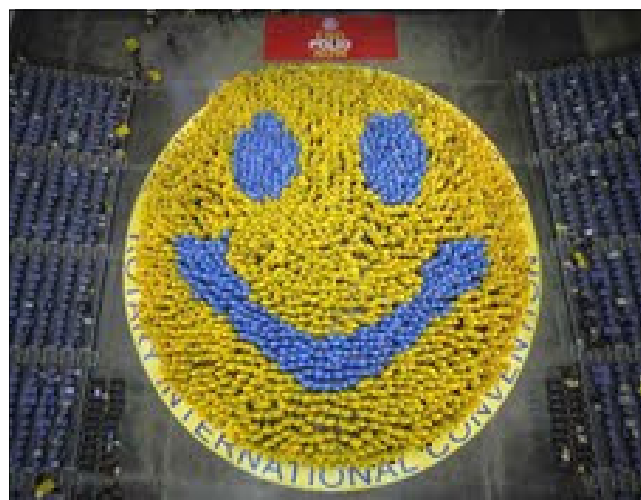
The most people who ever created a smiley face