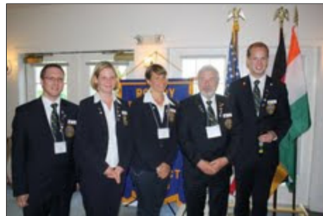
Our GSE Friends from District 1890