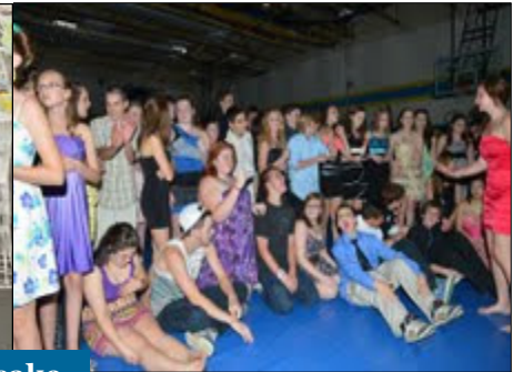
Interact dance group, and their cake