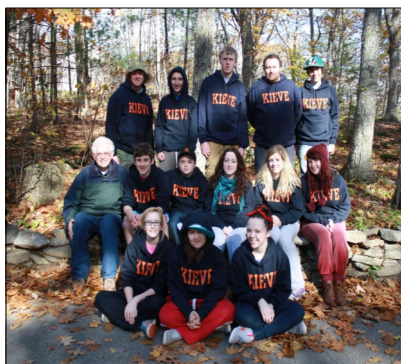
Camp Kieve hosts Friends Forever Carrickfergus

Want to have a great breakfast with some warm fellowship and a scintillating speaker? Come and visit us any Wednesday!