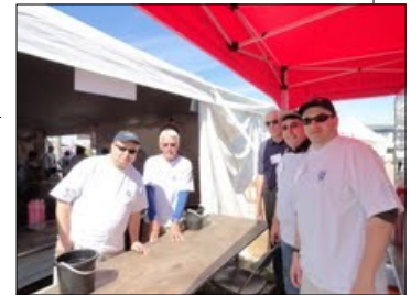
Reach the beach event