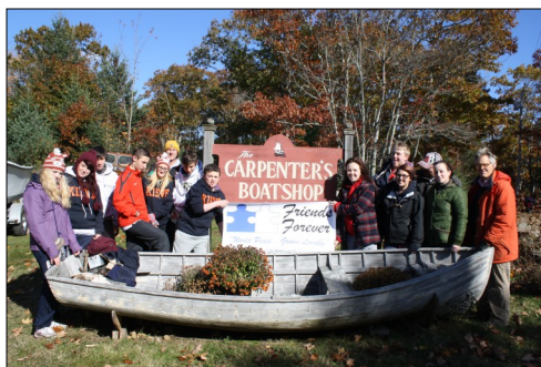
Friends Forever teens build Peace Bridges at The Carpenters Boatshop, Pemaquid ME