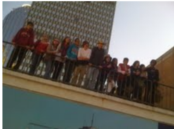
Orientation 2: Students from District 7730 & 7780 enjoying the many sites of Boston.