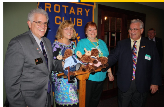
Celebrating Bridgeton Lake Region Rotary Club's 20th Anniversary