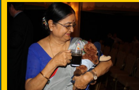
G.M. enjoys a coffee break with Binota Banerjee at the Zone Institute!