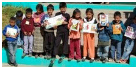
School children (Chixolis) where we work when they received storybooks for their classrooms for the first time.