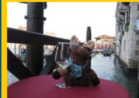
Biddeford Saco Moose "Myles" in Venice, Italy resting from his 34,000 mile journey to date!