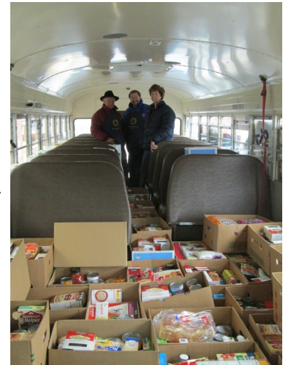
Brunswick Rotarians “stuff the bus” on last year’s World Peace and Understanding Day.