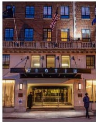
New entrance Westin Harborview

At the beautiful Five-Star downtown Westin Harborview Hotel in Portland Friday-Sunday, May 16-18