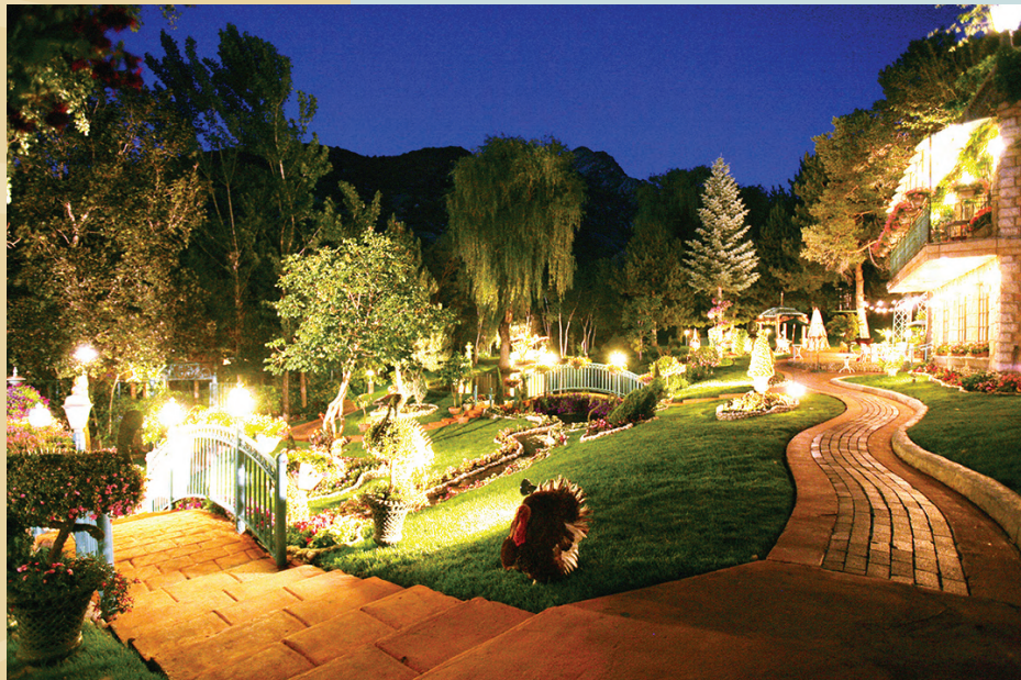
Site of the 2007 Arch C. Klumph Society Dinner

Another exciting feature of society membership is the annual Arch C. Klumph Society Dinner, held each year during the International Convention. This intimate event is an excellent way for members to meet like-minded Rotary leaders and celebrate all that has been done through their Foundation.