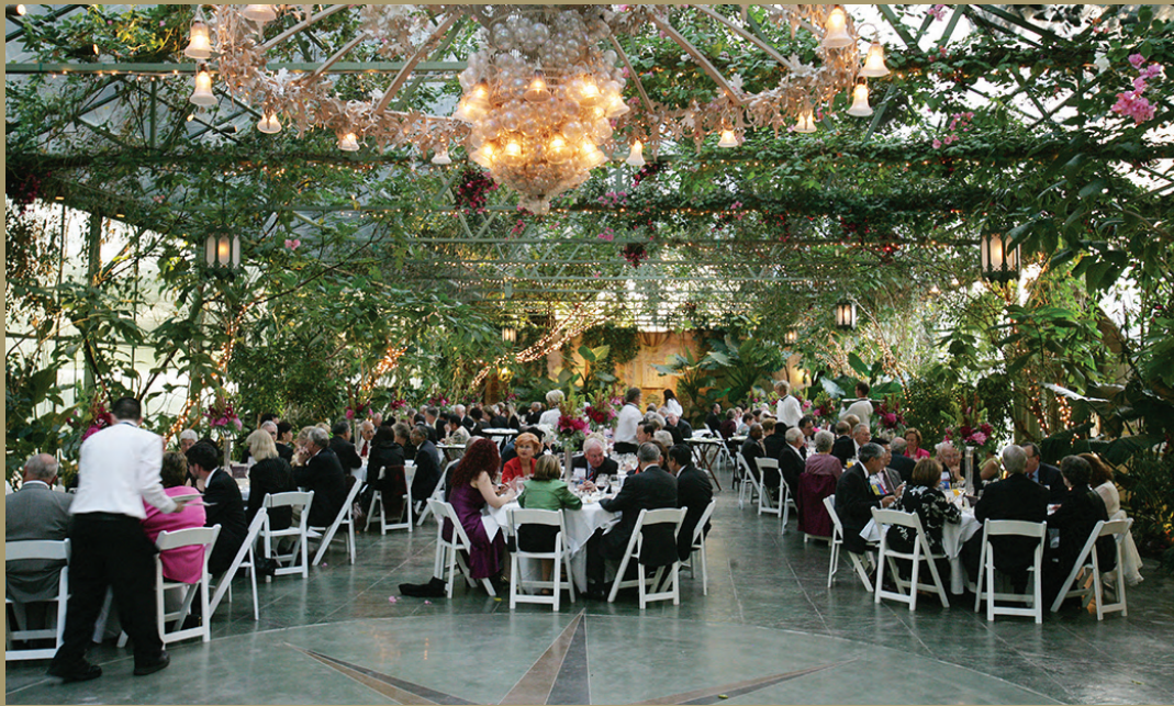
Site of the 2007 Arch C. Klumph Society Dinner