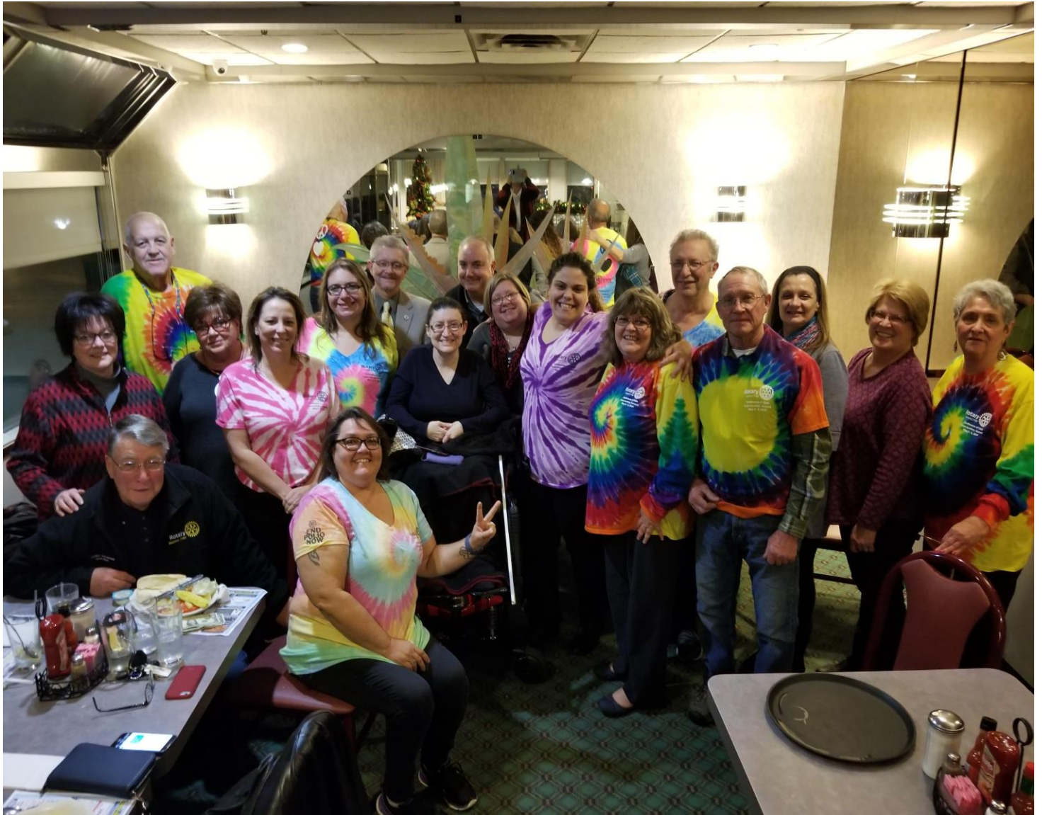
High energy, fun loving Rotarians at a recent get together planning the 2019 Conference of Clubs, to be held May 3 - 5, 2019 at the Essex Resort and Spa in Vermont.