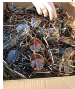
About 2000 pair of eyeglasses passed the sturdiness test.