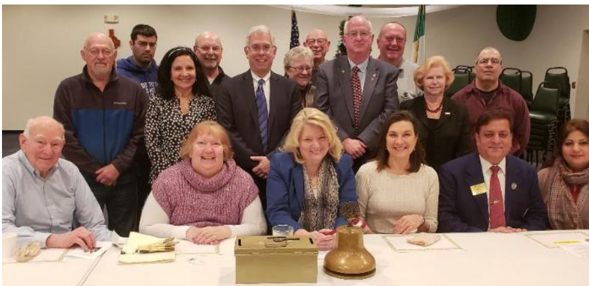
January 2 at SCHENECTADY EAST