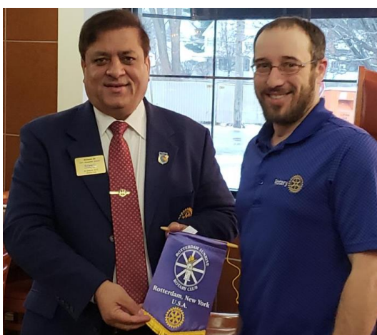
January 3 at ROTTERDAM SUNRISE ROTARY