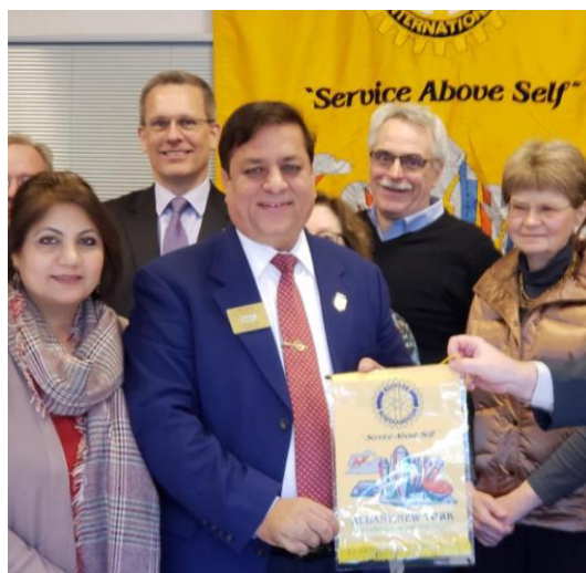
January 2 at ALBANY ROTARY