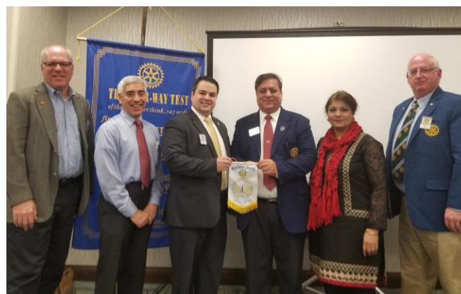
January 4 at GLENVILLE ROTARY