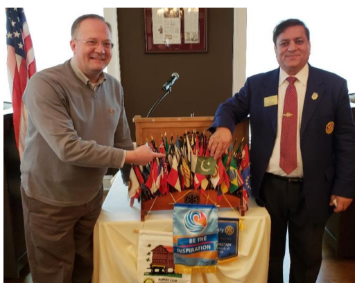
January 3 at SCHENECTADY ROTARY