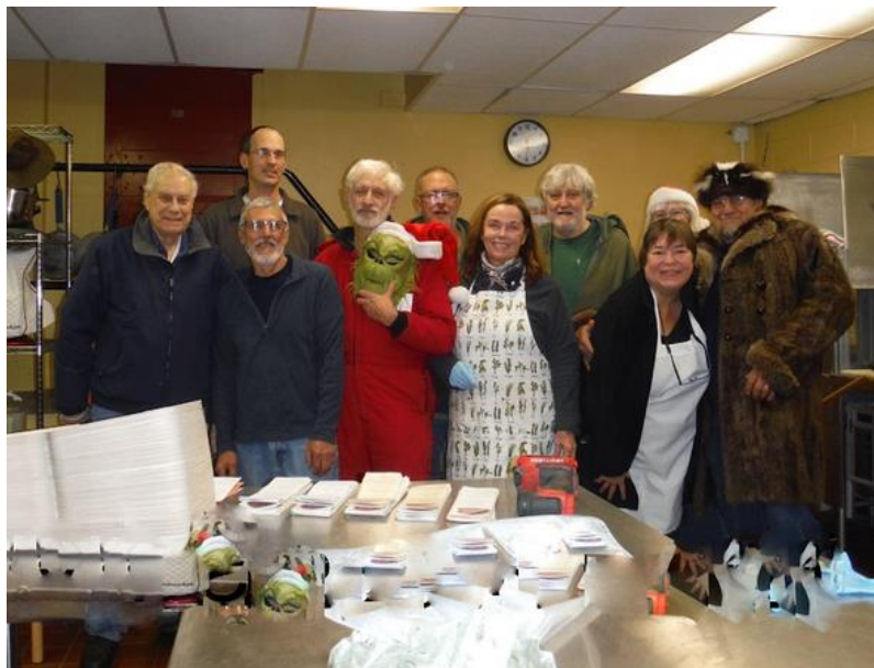
Salem Rotary Club members in photograph.