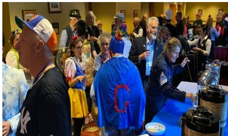
2022 District 7190 Conference Event