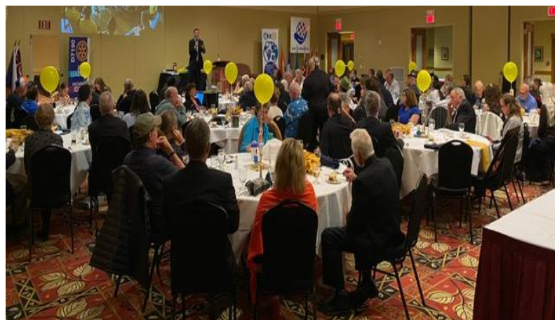
2022 District 7190 Conference