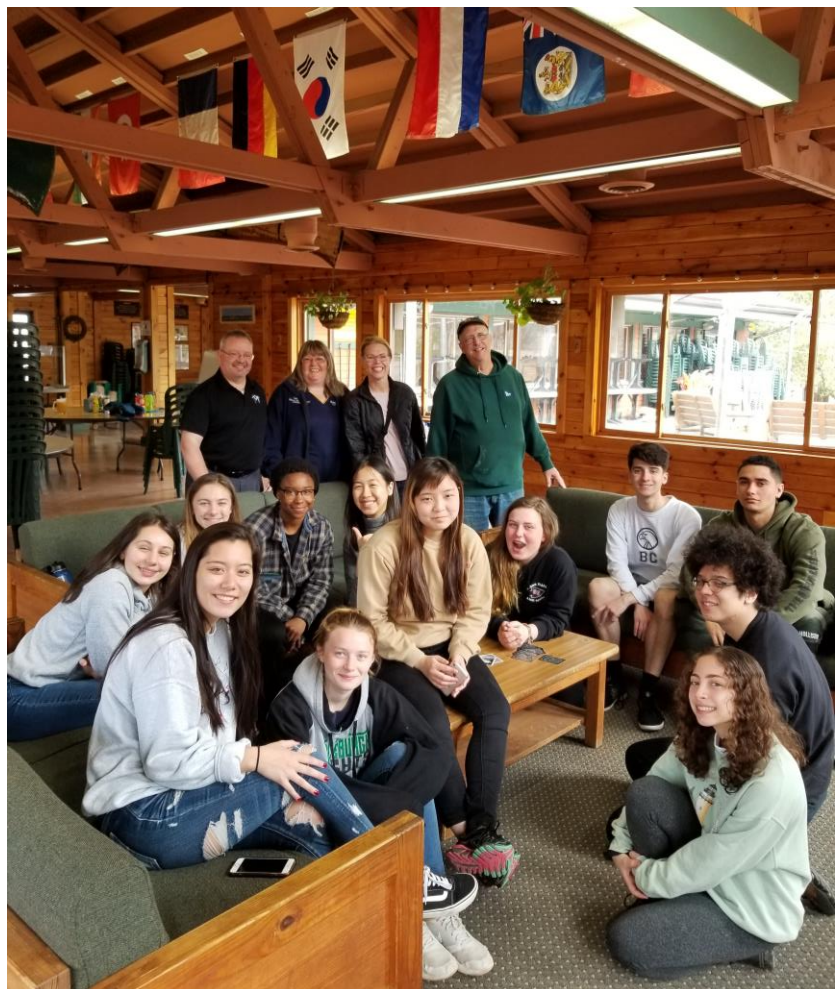
Youth Exchange Weekend