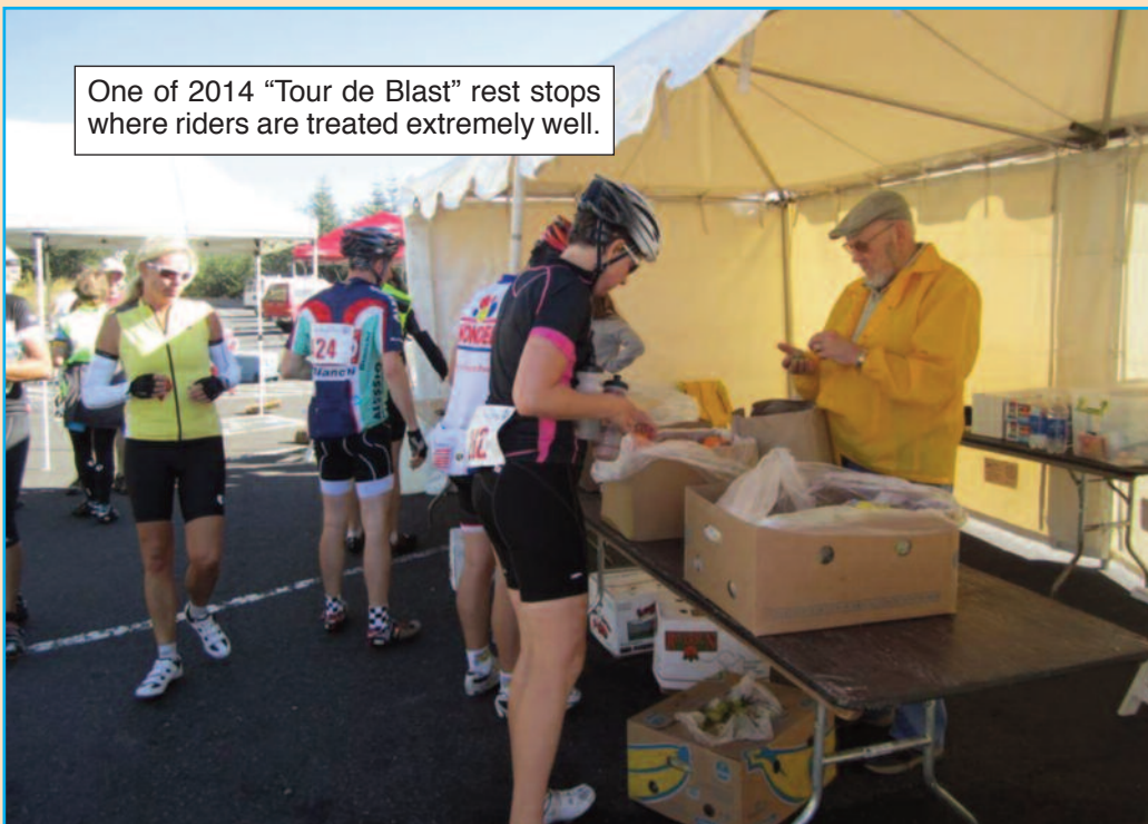
One of 2014 "Tour de Blast" rest stops where riders are treated extremely well.