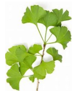
Ginkgo biloba leaves

Most of the Rotarians and Australia Exchange Student Rory Graham participated in the tree and/or ginkgo seed planting that was available for all before and after the Rotary