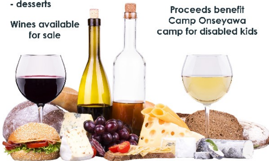
Photo from last year's event.

Proceeds benefit Camp Onseyawa camp for disabled kids