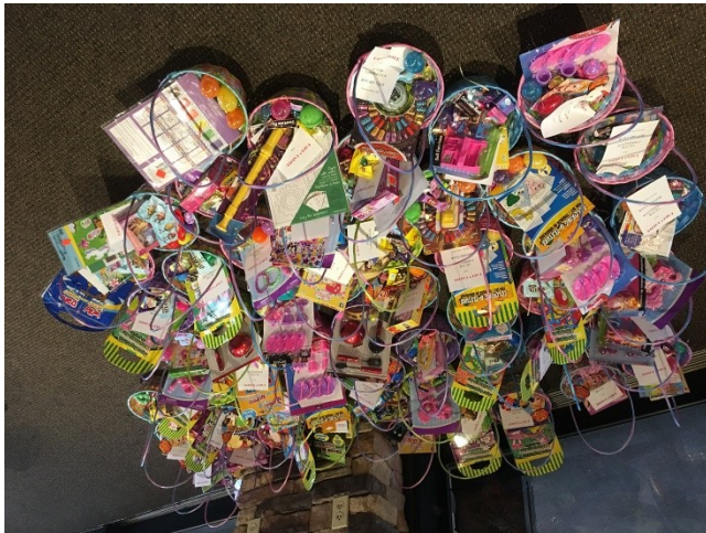
Easter baskets ready for delivery to Wilson Commencement Park

The Victor-Farmington Rotary Club continued a seventeen-year tradition by once again assembling Easter baskets for underprivileged children in Rochester. This year the club assembled one hundred baskets for children at the Wilson Commencement Park, a facility that assists low-income single-parent families transition from public assistance to financial independence and personal self-sufficiency.