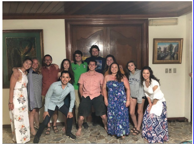
The Corning contingency on the International Service Trip to Talnique, El Salvador.