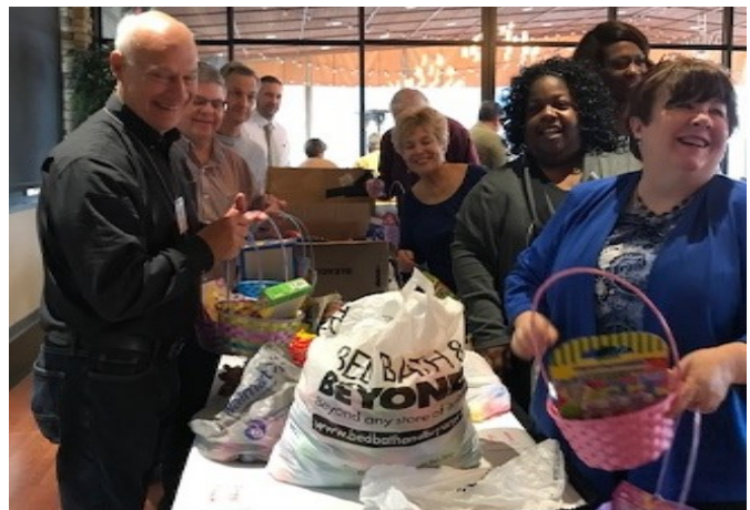
Rotarians and volunteers assembling the baskets.