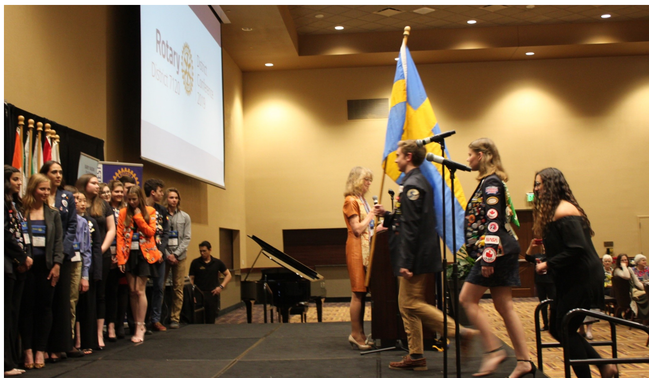
Inbound and outbound students (Sweden) presenting flag to conference