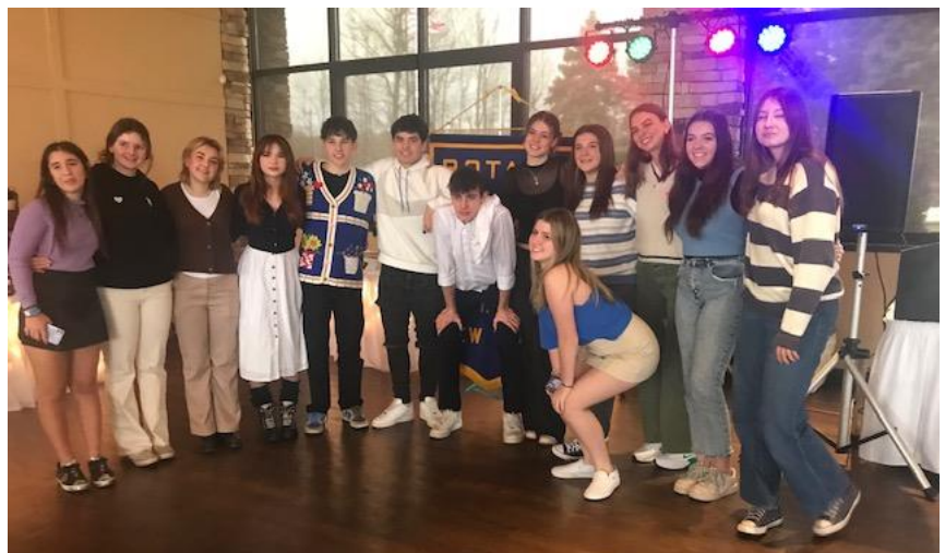
The YEX students being hosted by D-7120

Each student received a special T-shirt commemorating the event. The students took turns auto-graphing the shirts for each other as a remembrance of the event. After the brunch and opening events the district YEX Committee adjourned to a separate room for committee business while the students socialized and dance to music from a local DJ.