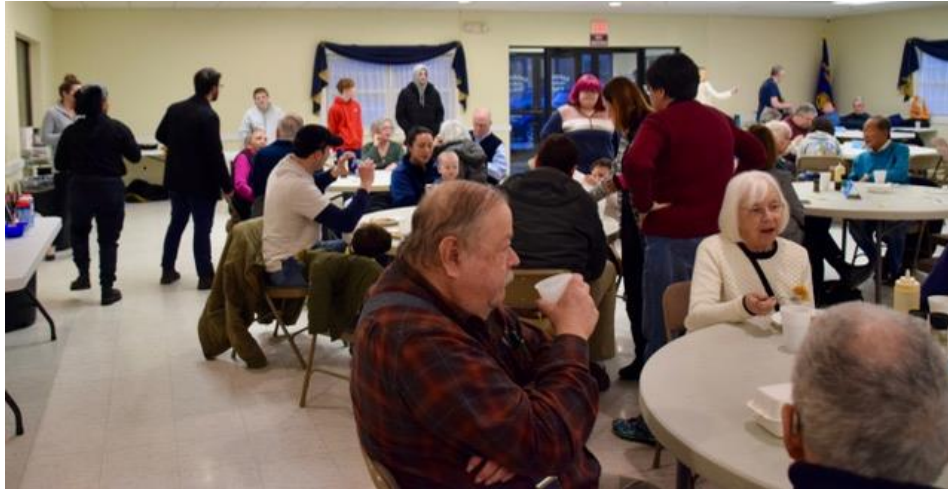
LEFT: Diners enjoying pancakes and conviviality.

Diners were entertained by the Rotary Band while Interact students helped serve and clean-up.