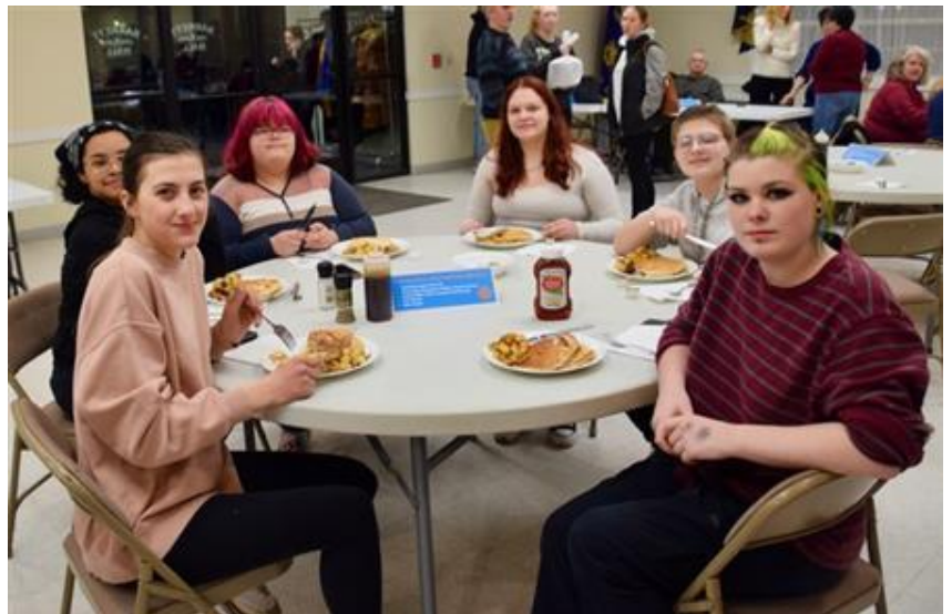
Interact students grabbing a quick meal at the end of the evening. Interact kids rule!