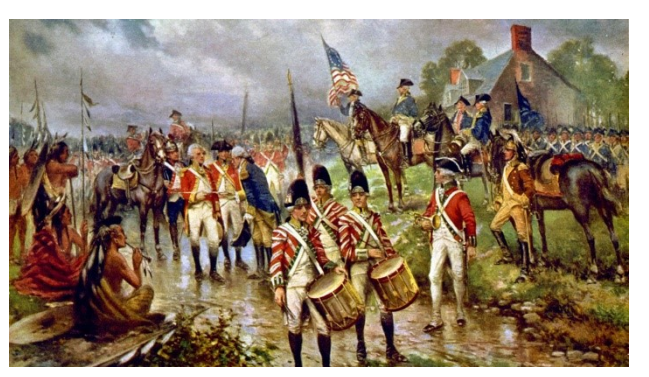
Surrender at Saratoga

The Civil War delayed the progress of the Association but eventually a monument recognizing the battle was erected on a site near the battlefield. The State of New York assumed the financial costs and responsibility for the monument.