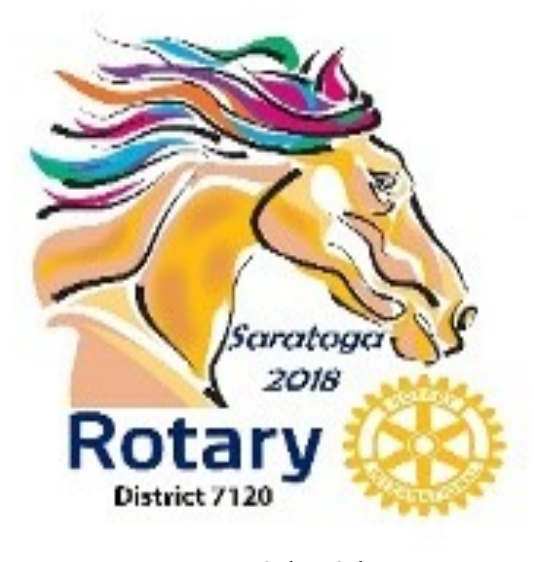
May 4th-6th Saratoga Springs, NY