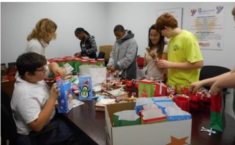
Ridgecrest Academy BOCES Interact students packing gift bags