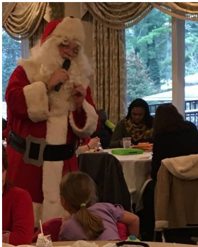
Santa serenades the party