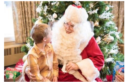
Santa listens to his Christmas wishes