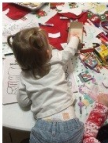
Coloring activity by an active child

to many children at the Annual Pancake Breakfast by Rochester Deaf Rotary Club (12/2/17)