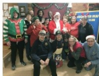
RDR Club members with Santa Claus