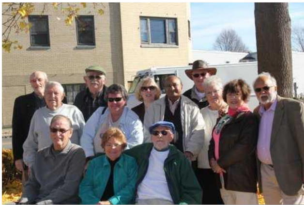
Pictured are members of the Elmira Heights Rotary Club at the dedication

What began as a dream 25 years ago, became a reality through the determined efforts of the EHRC. The revitalization of the park began with the construction of the bandstand in 1992. The success of the bandstand encouraged the club to consider adding a Picnic Pavilion in 2001. The Pavilion was an "instant hit" and popular site for family picnics and gathering place for a variety of community activities. Additional benches were installed throughout the park to accommodate visitors to the park.