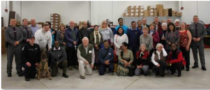
District 7120 Rotarians and International District Governors Elect at Troop E

Eight visiting Rotary Governors Elects and their spouses were part of a group of thirty-five Rotarians who visited the Troop E Headquarters of the New York State Police in Farmington as part of the Rotary Governor Elect Hospitality Program. The purpose of the visit was to give the guests an understanding of law enforcement issues and police services/procedures in New York State.