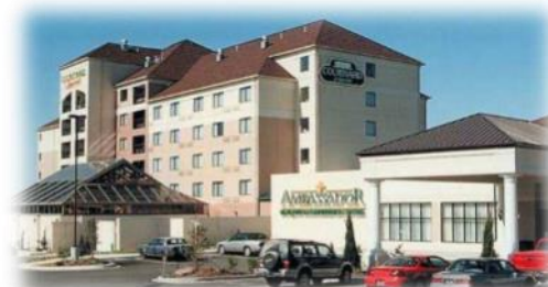
District 7120 - District Conference Erie, Pennsylvania