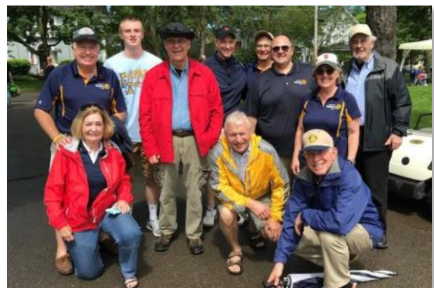
Pictured above - Some of our members and an Interact member helped the WWII and Korean veterans from their cars to attend the memorial service at the Fairport Memorial Day Parade.