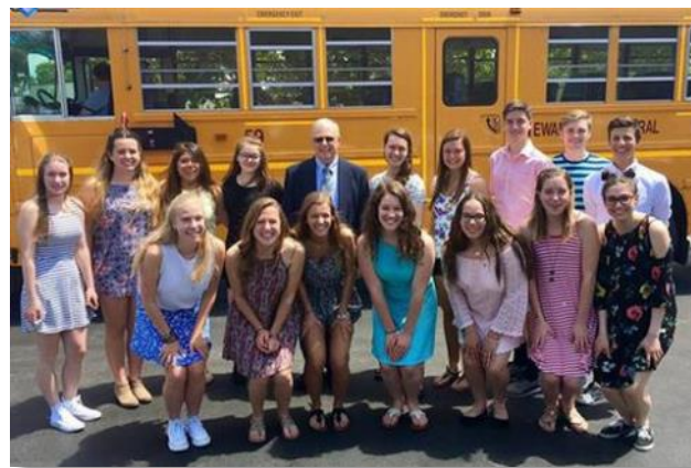
The Newark Rotary's Interact Club conducted the May 18th Rotary meeting and did a great job. We are proud of our future leaders.