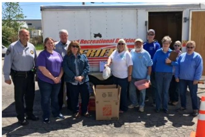
Pictured above - members of the Honeoye Lake Rotary Club join the sheriff's department collecting unused drugs for proper disposal.

On Saturday, May 20, 2017, the Honeoye Lake Rotary Club sponsored a "drug take back" program for the Town of Richmond in cooperation with the Partnership for Ontario County and the Ontario County Sheriff's Department. While the club members approached cars and walk-ups as they offered the unwanted drugs to be destroyed, the Sheriff's Department boxed the disposed drugs to be taken away for disposal. The exchanges went smoothly and those who were able to get rid of their unwanted prescriptions and other drugs were thankful to be rid of them as pharmacies are no longer allowed to receive old medications/medicines.