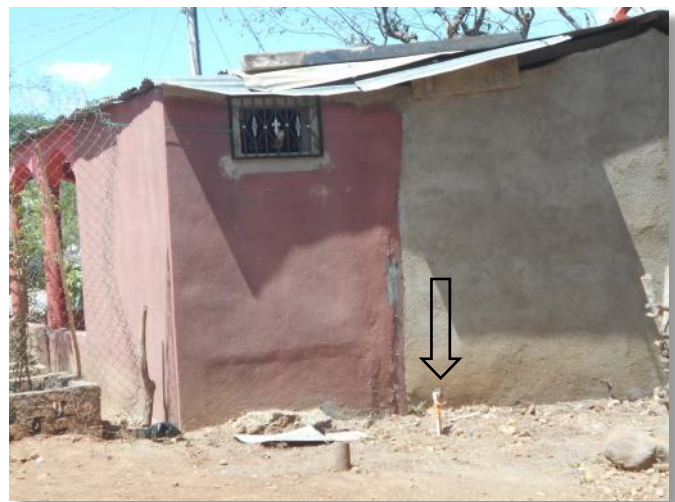
Above picture shows a spigot for potable water outside a village home

The villagers will be digging trenches and laying distribution piping to the village homes. The municipality will supply the labor to install the pump, chlorinator and tank. An NGO, Enlace Project, will manage the project and provide engineering expertise. Each home will receive a spigot outside their front door. (Homes in the villages of Nicaragua