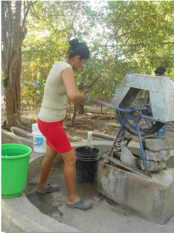
Woman pumping water preparing to carry it to her home.

The Victor-Farmington Rotary club first started doing humanitarian global grant work in Nicaragua in 2007. Since that time, three global grant projects have been completed and a fourth is currently in the grant application stage. This current project is a water project in the village of LaPalma. The club completed a similar water project in 2016 in the village of Salales.