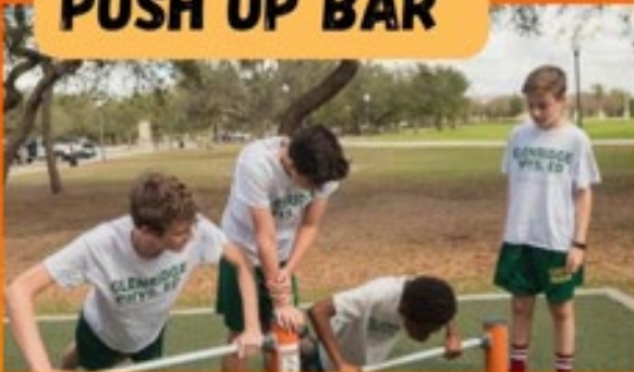
PUSH UP BAR