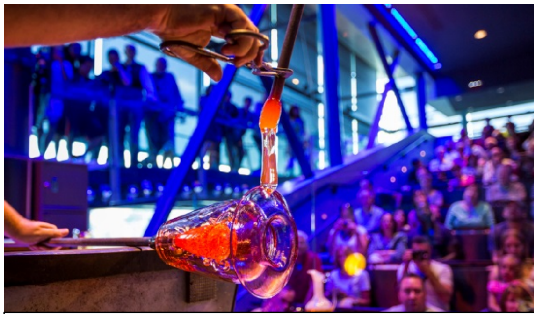
Corning Museum of Glass (Hot Glass Blowing)