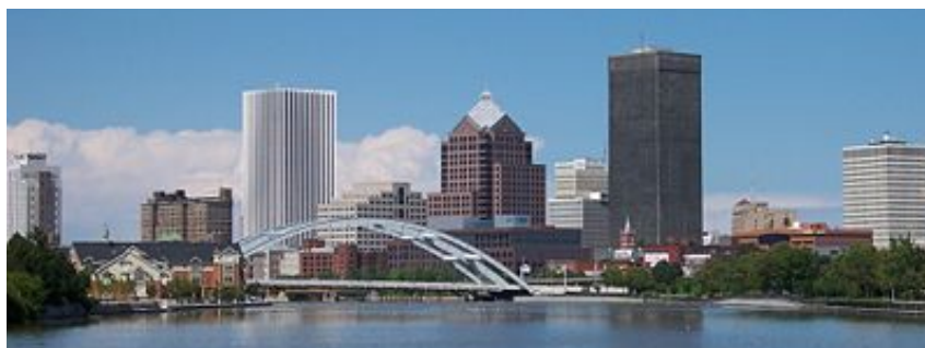
The Genesee River and Skyline of Rochester, NY