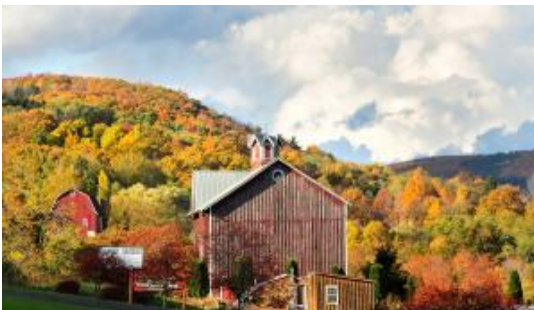
Farm Nestled in Rolling Hills