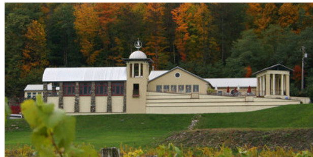
Heron Hills Winery and Tasting Room