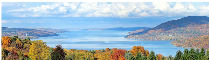
Another Beautiful Fall Day in New York's Finger Lakes Region

Following is a brief photo gallery essay of Rotary District 7120