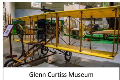
Glenn Curtiss Museum