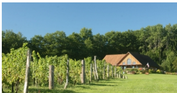
One of Many Grape Vineyards in the Region