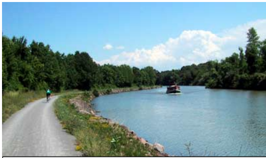
Historic Erie Canal (Towpath)