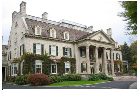
Eastman House (Museum of Photography)