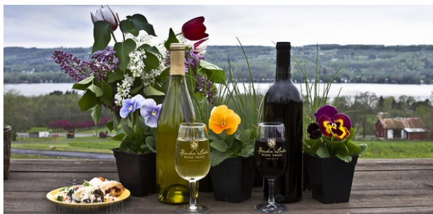
A Beautiful Day and Delicious Lunch in the Finger Lakes