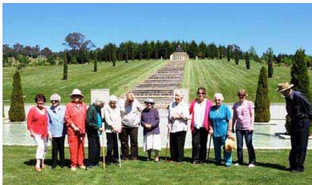
Hathaway residents enjoyed their day at iconic Mayfield Garden