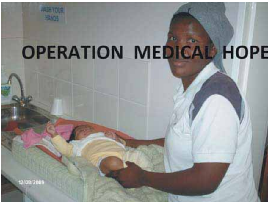
Photo - Left - Operation Medical Hope saving children

Photo - Above - Coolamon House Clinic in Cape Town, South Africa