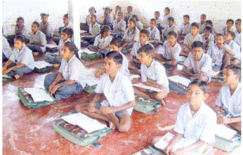
Photo: New school kits proudly displayed by village children in India

The US$55,163 Matching Grant was completed through a funding partnership between District 9700 and Rotary Club of Castle Hill, Australia and District 3291 and the Rotary Club of Calcutta Mega City, India and The Rotary Foundation.