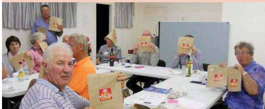
Photo: Oberon paper bag meal meeting

D9700 Rotary Clubs who may be preparing for the distribution stage the fruits of their hard work over the year, please remember polio is 99.9% eliminated throughout the world. We need to maintain the pressure (and funds) to ensure this disease is eliminated completely. While virtually unknown to most Australians today, the infectious nature of the disease means we must finish the job – and eliminate polio completely.