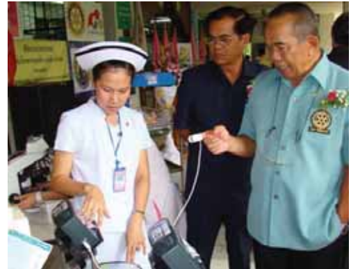
Photo Some of the urgently needed medical equipment at the Ban MaeToen hospital

After completing our fresh water project in Ban MaeToen, we were asked if we could further assist the region with the purchase of urgently needed medical equipment for the Ban MaePrik Hospital. The Club contributed $US5,000, District Designated Fund $US6,500 and with Matching Grant Funds from the Rotary Foundation, over $US20,000 worth of equipment was purchased, with an official handover ceremony at Ban MaePrik Hospital.