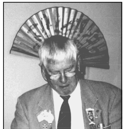
A Grand Pooh-Bah in full ceremonial headdress

CITYBANK AUSTRALIA PROUD PARTNERS IN COMMUNITY SERVICE WITH AUSTRALIAN ROTARIANS