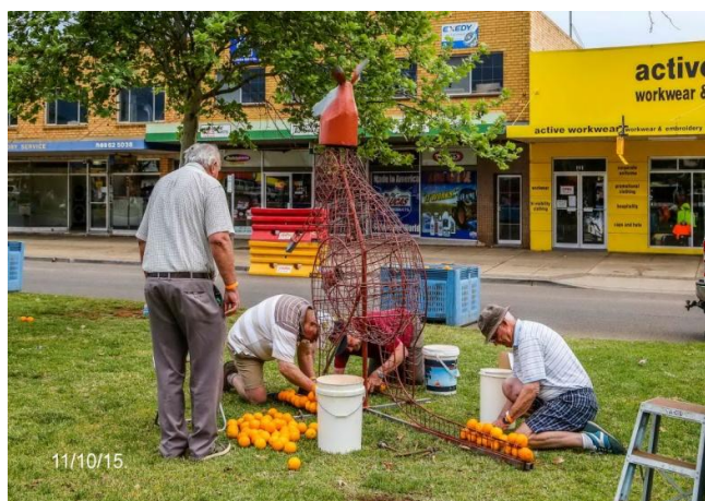
Banna Ave kangaroo orange cage ready to fill