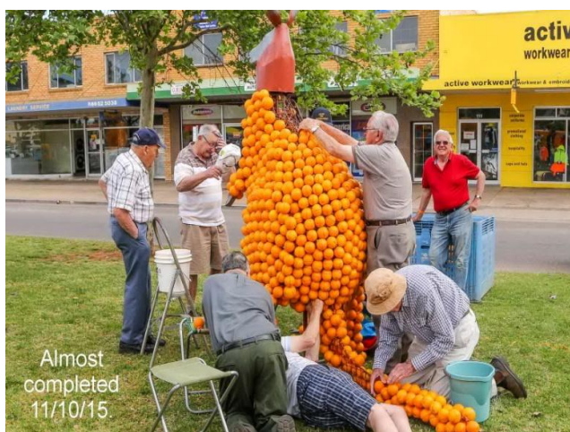
OK, go get the Barbie fired up