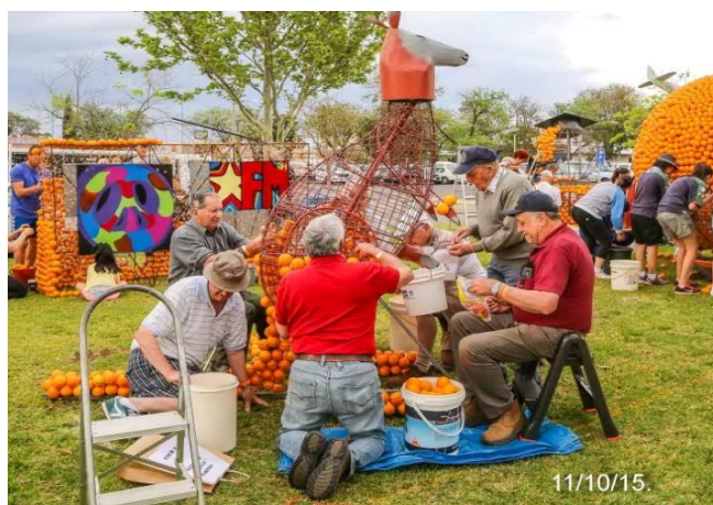
Who says Probus blokes can't chuck oranges around?