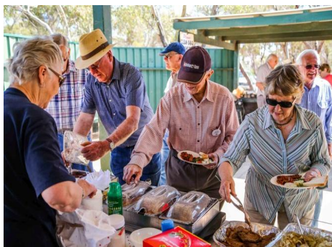
No thanks, we don't really want kangaroo steaks!