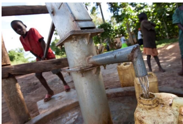
Providing Clean Water

Successful applicants will need to provide proof of university admission to a graduate-level program or letter of invitation to conduct postgraduate-level research in order for scholarship funding to be approved. Admission that requires a grant of financial support or is dependent on the completion of an undergraduate degree is acceptable. Admission that is contingent on improvement in a language score, however, is unacceptable.