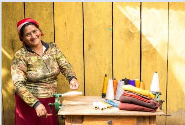
Growing Local Economies

Rotary is a global network of community volunteers. Rotary members are business, professional, and community leaders who provide humanitarian service, encourage high ethical standards, and help goodwill and peace in the world.