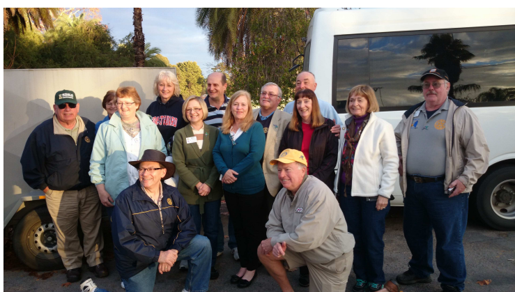
District 7120 Team members departing Narrandera