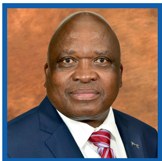
Dr Joe Phaahla Minister of Health

Hear messages of support from some of our partners: Government, SANAC, Civil Society, RFHA, Rotary, the Disability Sector