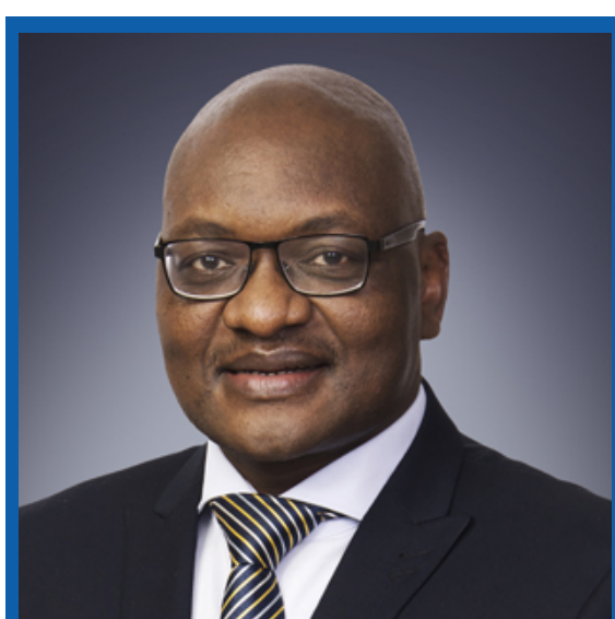
Mr David Makhura Gauteng Premier