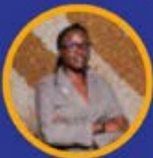
Purple Kisakye NEM