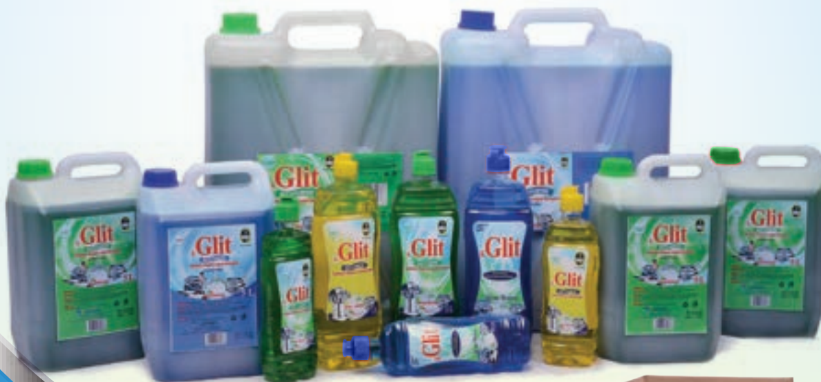
LIQUID DETERGENT, DISH & HAND WASH

TOUGH ON: Grease, Stains, Dirt, Repels flies & Scales