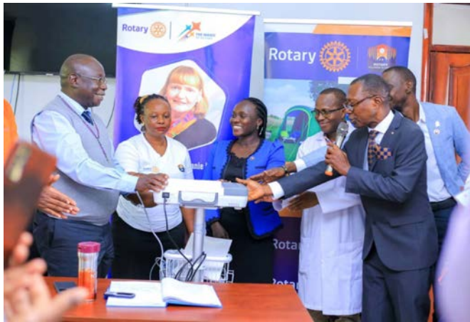
Handing over ECG machine to Masaaka Refeeral Hospital