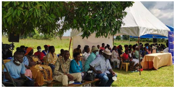
Community Listening to health Education talk

In Ngoma, the anthill of Wobulenzi proved that service knows no borders. Like ants carrying food far beyond the mound, Rotarians took service where it was needed most. The medical camp was more than a prelude to the Cancer Run, it was a demonstration that when we Unite for Good, no one should be left behind in the fight for health and hope.