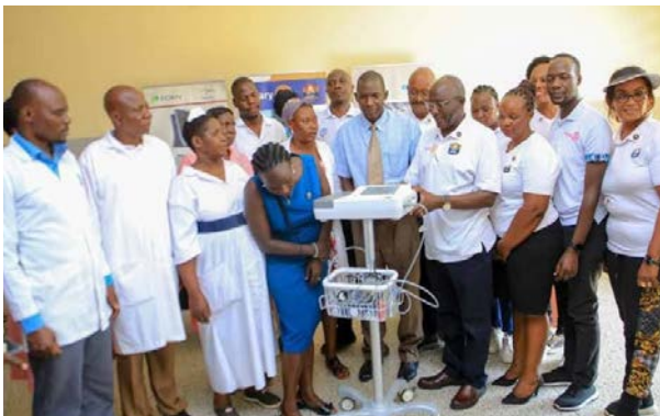
Donation of ECG Machine to Busolwe General Hospital