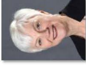
RI DIRECTOR ZONE 8 2021-23