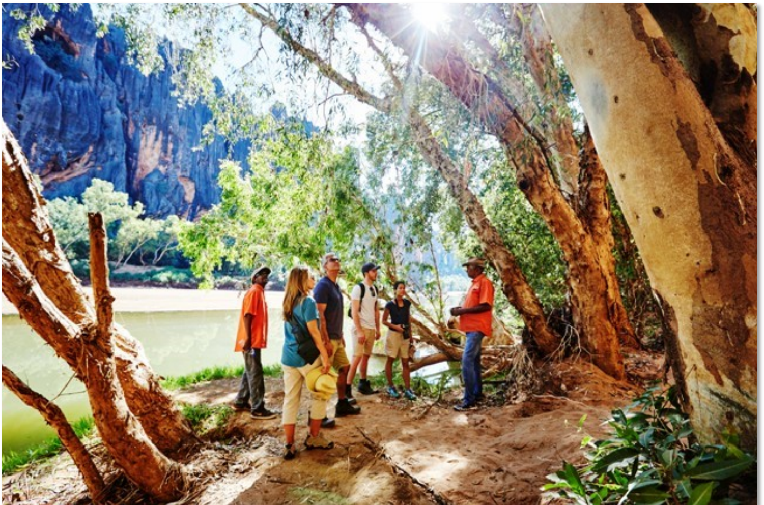
Windjana Gorge National Park

For more details, visit: https://www.ourwaparks.org.au/get-involved/