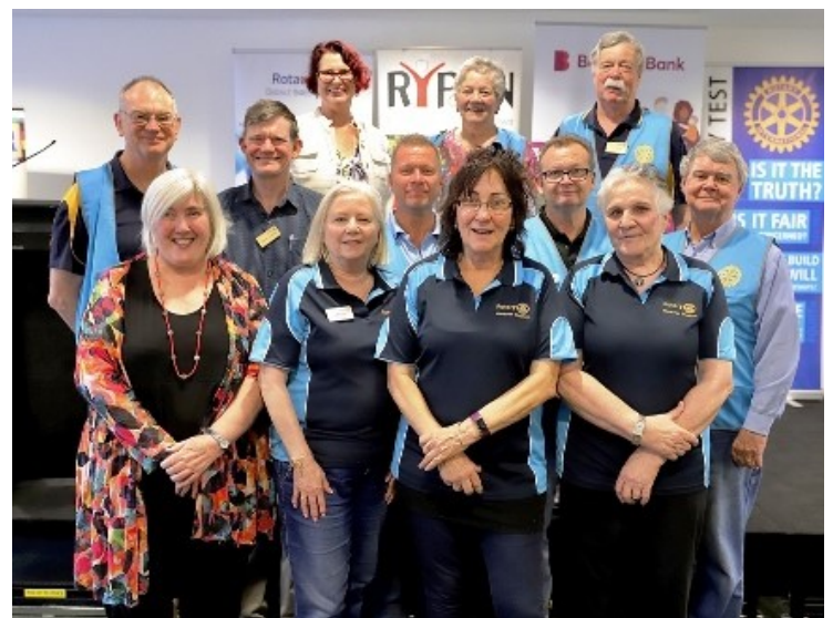
The 4-Way Test committee and volunteers that helped set up and pack down or contributed on the day of the event