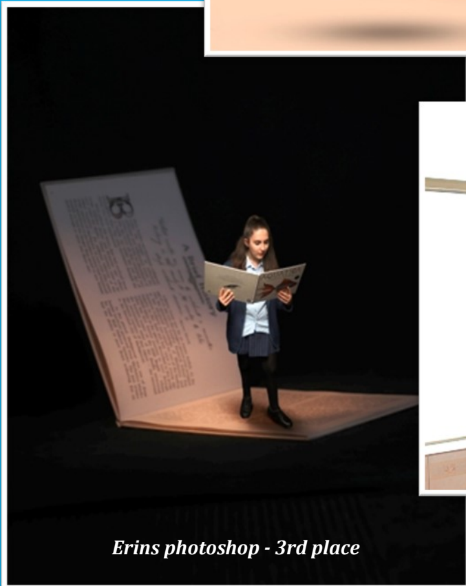
Erins photoshop - 3rd place