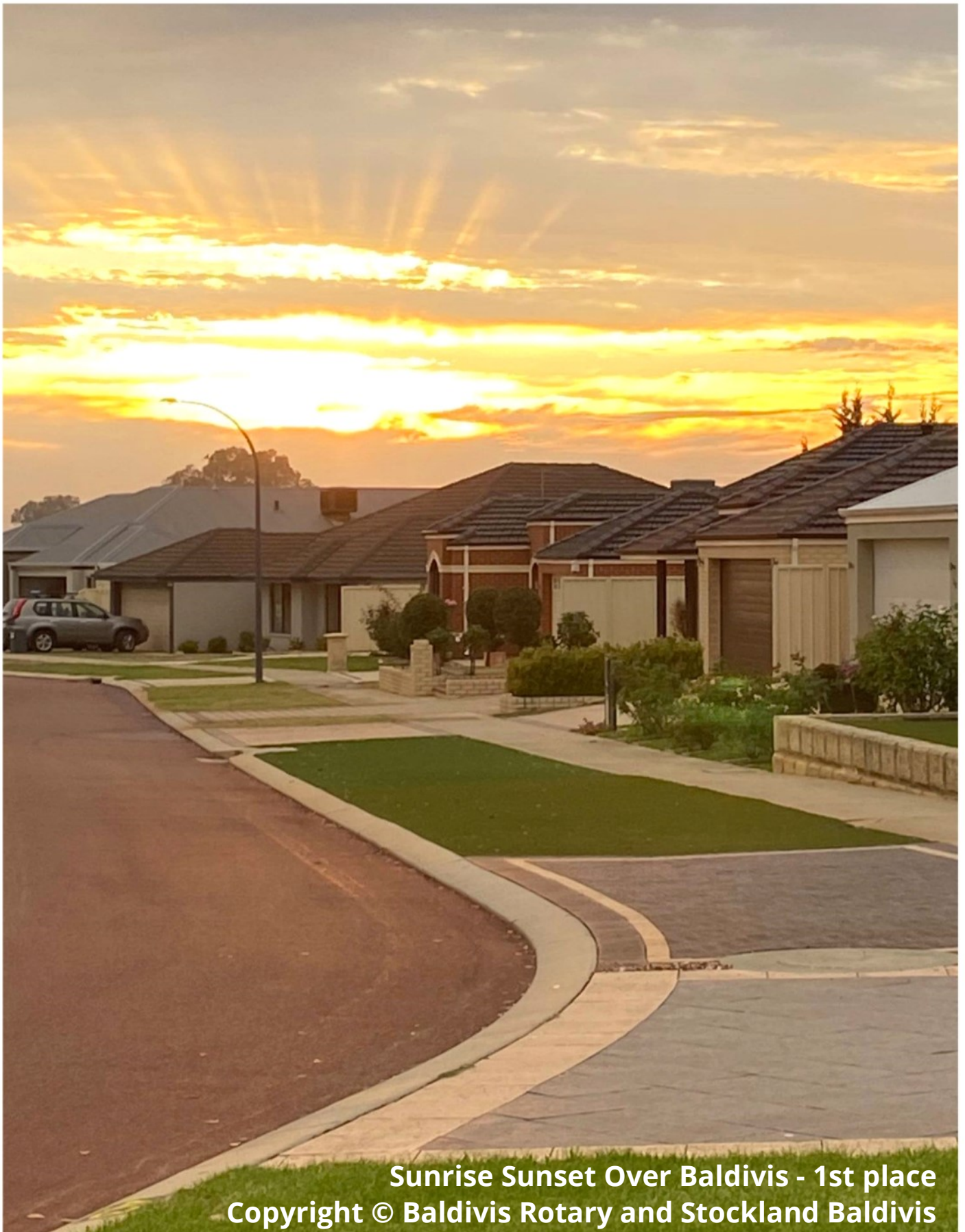
Sunrise Sunset Over Baldivis - 1st place